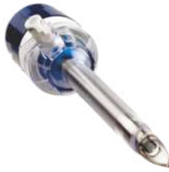
UL-3IT Trocar UL-3VT optical Disposable Trocar