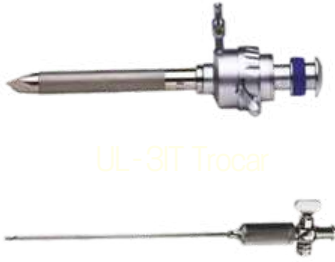
UL-3VN Veress Needle