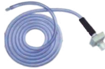
UL-3STM Tubing set

Insufflator Tube | Foot Switch | Insufflator Smoke Evacuation Tube | Insufflator Filters | Smoke Evacuation Filters | UHPA Filter | Humidifier Bottel